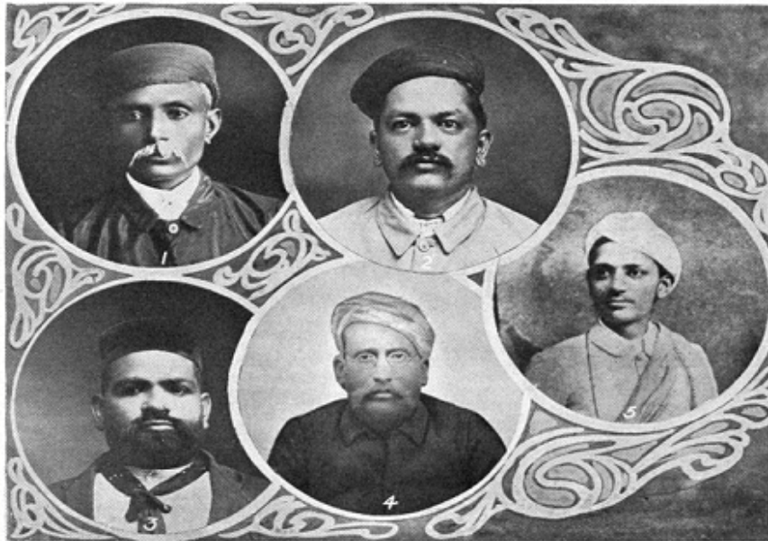
NATIVE MERCHANTS OF RANGOON.